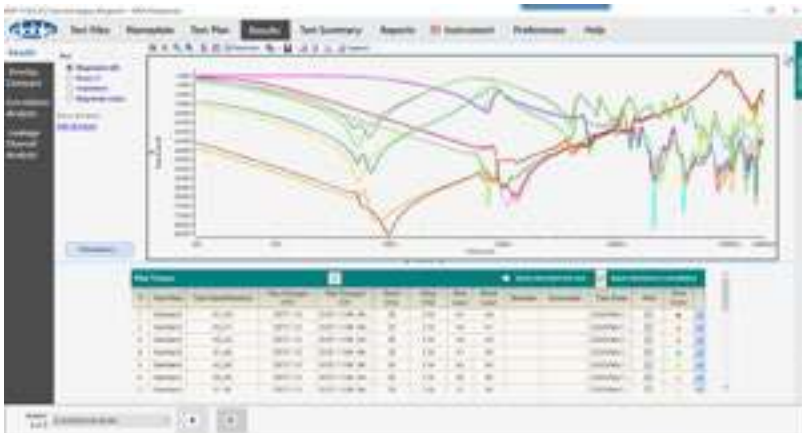
View of SFRA V6 test results.