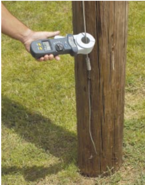
The DET20C instrument is shown being used to test a pole ground.