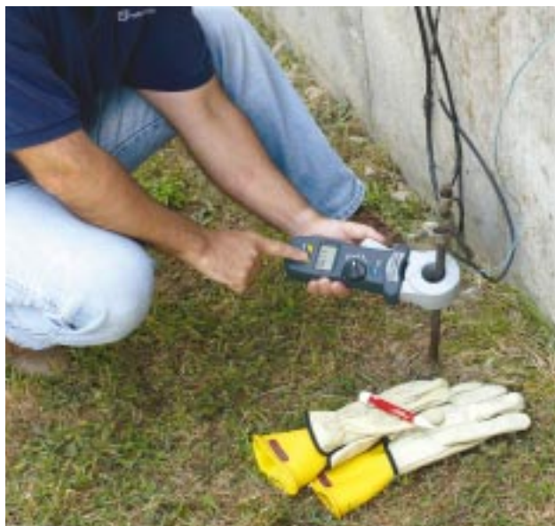
The DET20C instrument is shown being used to test a facility ground.