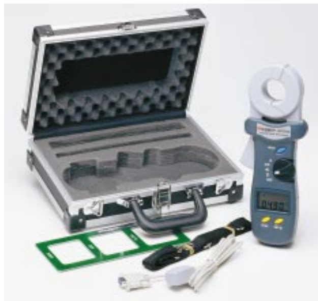
DET10C and 20C comes with a rugged carry case, calibration fixture, carry case shoulder strap and RS-232 cable (DET20C only).