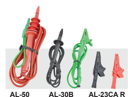
_-50 AL-30B AL-23CA R AL-30AG AL-23CA B